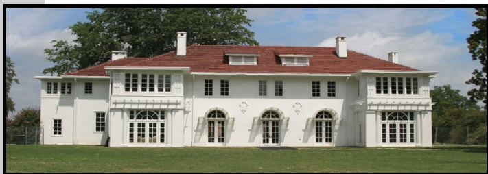
J. W. Cutrer House